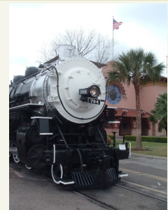
Southern Pacific #794 located at Sunset Station, San Antonio, TX